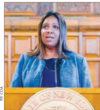
N.Y. Attorney General Letitia James

In a statement, one of the plaintiffs, New York Attorney General Letitia James, said: "Our Constitution is clear: it is up to the states and Congress, not the president, to set the rules governing our elections. This Executive Order would