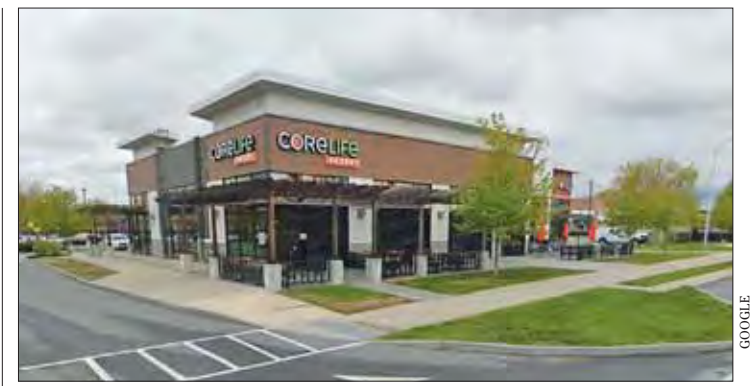
CoreLife Eatery in Clifton Park, New York.

"Clearly, the Constitution reserves the right to state legislatures and state governments to govern elections,"