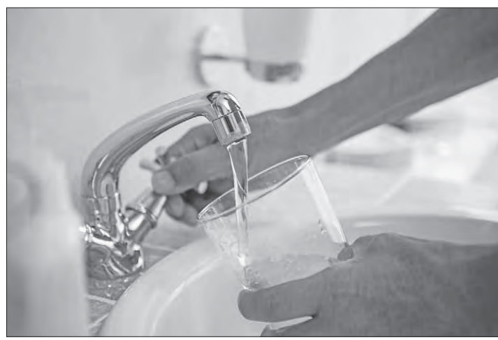
President Donald Trump has rescinded a Biden administration plan to limit chemical discharge into drinking water, leaving state regulators waiting for EPA guidance on PFAS monitoring and treatment in discharge permits.

"They missed the opportunity to promise they will protect the two most important rules EPA put out on PFAS that are now being chal-