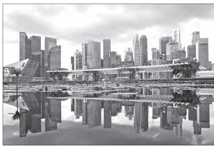
Central Business District in Singapore. An expected reduction in business activity over the next few months will have a direct impact on local legal markets as clients opt for a wait-and-see approach.

The lack of client engagement in certain jurisdictions could in part be cultural, said Malaysian firm