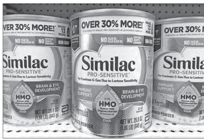
Thousands of lawsuits have been filed over a formula given to premature babies in hospitals, sold under the brands Enfamil and Similac.

But Pallmeyer, in a separate summary judgment ruling, also refused to toss the two general