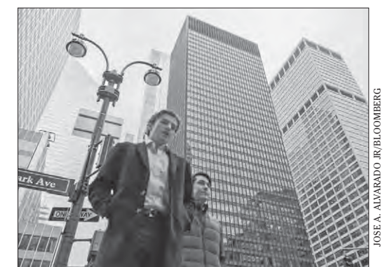
Demand has pulled back in Manhattan after being one of the hottest office recovery markets in the country.

The analysis revealed that the Dallas-Fort Worth MSA leads the country in multifamily » Page 7