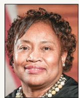
Judge Shirley Troutman