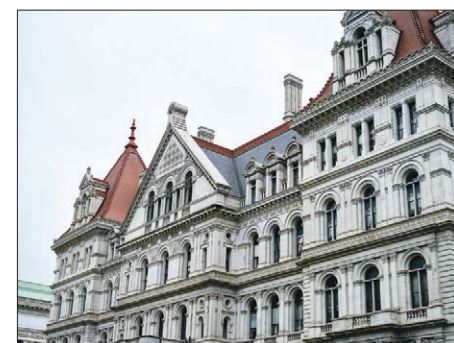
The Grieving Families Act, consent to jurisdiction on matters arising outside of New York, and the ability to recover awards from third-party defendants are legislative targets of the nationwide network of legal reform organizations.

S5170/A3351, which would allow a plaintiff to recover money directly from a third-party defendant, if the original defendant doesn’t pay the judgment within 30 days. It was passed by state lawmakers during