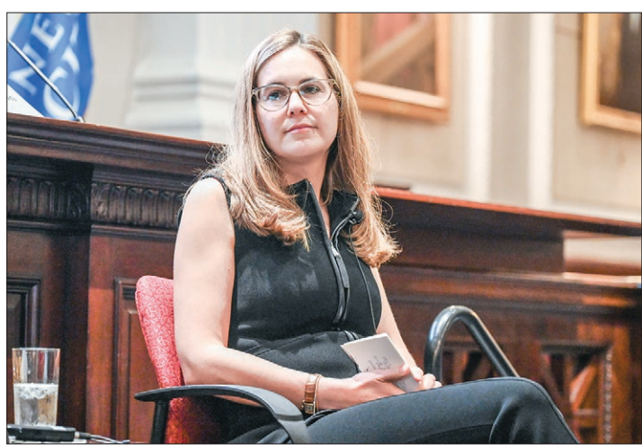
Former acting U.S. Attorney Danielle Sassoon is one of a number of departures from the of the Southern District of New York in recent months.