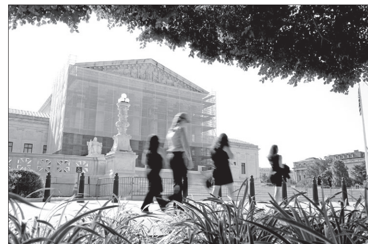
The precedential value of the Supreme Court's emergency orders has emerged as a key question during President Donald Trump's second term.

"The court that issued that order, what is that court supposed