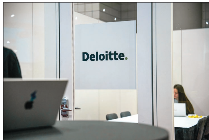
Zora Labs, a Deloitte Tax client, alleged that Deloitte’s “Zora AI” is too similar to its domain, creating potential user confusion and reputational harm.