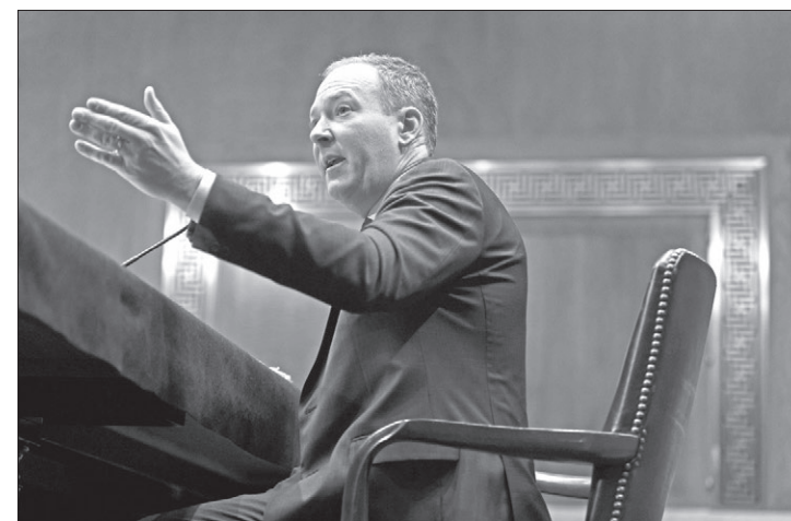
EPA Administrator Lee Zeldin said regulations limiting greenhouse gas emissions are more harmful to Americans than the greenhouse gases themselves.

"NRDC's lawyers and scientists are not going to let that happen