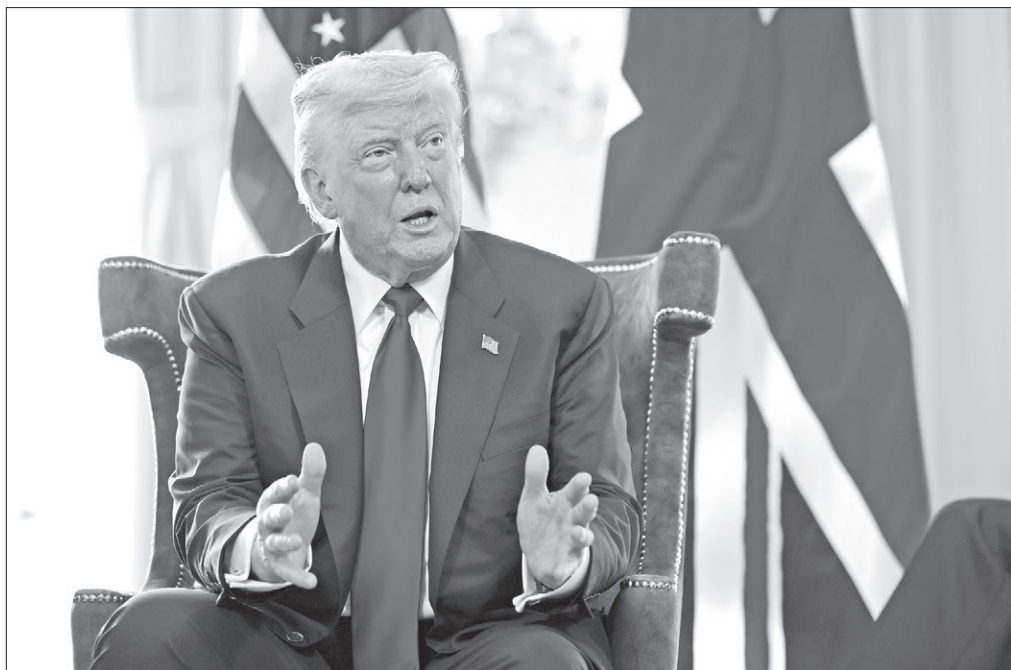
President Donald Trump publicly proclaimed that federal judges who oppose him should be impeached.