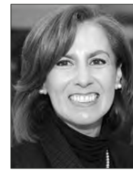
Justice Consuelo Mallafre Melendez Supreme Court

In a dental malpractice case, plaintiff moved for leave to amend the complaint to add individual dentists employed by the defendant dental practice as new party defendants. Two of the proposed defendants filed opposition based on the statute of limitations. Plaintiff argued that the claims were timely pursuant to relation-back or continuous treatment. The court held that the relation-back doctrine applied as to one of the defendants. Additionally, the court found the continuous treatment of subsequent providers at the practice may be imputed to both defendants, rendering the claims against them timely. The court therefore granted Plaintiff's motion.