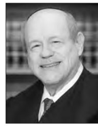
Justice Aaron D. Maslow Supreme Court

The petition in a special proceeding, brought on by order to show cause, alleged that petitioner was injured in an accident on June 22, 2025, whereby the gate or door to the freight elevator fell on him at 640 Columbia Street, in Brooklyn. Petitioner sought pre-action discovery. A preliminary injunction preventing removal or destruction of evidence was also sought. The court noted that there were insufficient details and no affidavit from petitioner himself. Without the information, the court could not determine whether there was a cause of action, such that pre-action discovery was warranted. Additionally, a preliminary injunction may not be granted in the absence of a pending action. The petition was denied, and the special proceeding was dismissed.