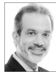
District Judge Gary R. Brown Eastern District

Plaintiffs, a Lubavitch religious organization and its rabbi, sought to build a Chabad on land in the Village of Old Westbury. They alleged the Village thwarted that effort chiefly via adoption of a land use statute aimed at places of worship. In a case approaching its second decade of pendency, plaintiffs sought partial summary judgment. The instant court found that plaintiffs' motion for partial summary judgment as to its facial challenge to the Village's Places of Worship (POW) Law as a deprivation of their right to the Free Exercise of religion was the only meritorious motion now before it. In 2024, the court held that, compared to the religious uses specified in the POW Law, "the Village imposes less onerous requisites on landowners who opt to develop land for residential purposes" and "provides far more generous provisions for many types of non-residential, commercial and public development. The record now available demonstrates many more ways in which the POW Law treats religious development less favorably than comparable secular land uses. Thus, the court granted plaintiffs' motion and declared the POW Law facially invalid under the U.S. Constitution.