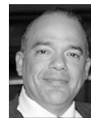
Justice Francois A. Rivera Supreme Court

Plaintiff, in a breach of contract action, sought an order granting summary judgment in plaintiff’s favor on the first cause of action in the principal amount of $43,000, with interest, an order granting summary judgment on the second cause of action for attorney’s fees and severing that cause of action for a hearing to compute those fees, and for an order dismissing the defendant’s affirmative defenses and counterclaim. The branches of the motion directing entry of summary judgment as to the first and second causes of action were denied and the branch of the motion dismissing defendant’s affirmative defenses was granted in part and denied in part. The court held plaintiff did not establish entitlement to summary judgment against the breach of contract for failure to pay on a promissory note and consequently the branch of the motion for attorney’s fees based on the breach was denied. The court struck the affirmative defenses that were not addressed by the defendant, but denied striking the affirmative defense that the complaint fails to state a cause of action.