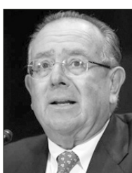
District Judge Philip M. Halpern Southern District

Plaintiff Clapp’s pro se January 2024 lawsuit pressed claims of violation of his constitutional rights and state-law negligence. On July 1, 2024, he was permitted to proceed in forma pauperis (IFP). In addition to dismissal under FRCP 12(b)(6) defendants sought revocation of plaintiff’s IFP status pursuant to 28 USC §1915(g). The court revoked plaintiff’s IFP status—but otherwise denied defendants’ dismissal motion—warning plaintiff that if he did not pay the appropriate filing fees within 30 days his instant lawsuit would be dismissed without prejudice. The court agreed with defendants that Clapp had at least “three strikes” under the Prison Litigation Reform Act. While in prison Clapp filed at least six other cases that were dismissed as frivolous, malicious, or for failure to state a claim. Clapp’s actions so dismissed prior to the PLRA’s enactment count as “strikes” for purposes of §1915(g). Clapp did not allege that he was under “imminent danger of serious physical injury.” Nor did his allegations demonstrate that he was or is in imminent danger.