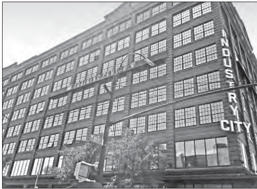
Industry City in Sunset Park, Brooklyn

The biggest chunk of the space (55,000 square feet) will be occupied by Cresilon. The hemostatic technologies-focused company deal is a 10-year expansion and extension, which more than doubles from its 27,000 square feet it previously occupied at the property. The lease broadens the Brooklyn-based firm’s lab and headquarters space at the property » Page 7