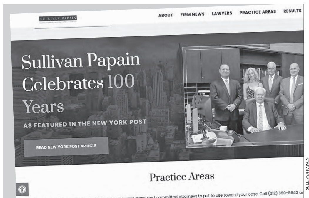
Personal injury firm Sullivan, Papain, Block, McManus, Coffinas & Cannavo recently celebrated its 100th anniversary.