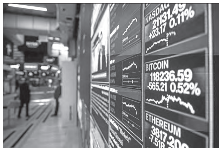
The case dates back to mid-2024, when Boyd and Boggs began soliciting crypto investments for an artificial intelligence trading system.

But behind the façade, the plaintiffs alleged that Boyd embedded hidden code that rerouted deposits to private wallets he controlled. Funds were allegedly broken into "dust" transactions, recycled through circular trades and laundered through non-custodial