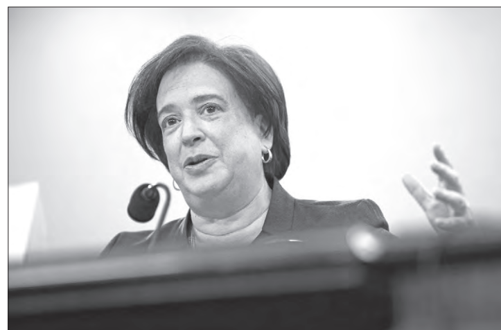
Dissenting, Justice Elena Kagan said the court's emergency docket should not be used "to transfer government authority from Congress to the President, and thus to reshape the Nation's separation of powers."

The court's order on Monday is an extraordinary development in the area of administrative and, indeed, constitutional law. When the FTC was created 111 years ago, Congress ensured that commissioners could not be removed by the president for cause. The Supreme Court upheld that statutory independence from direct White House control in a landmark case in 1935 known as Humphrey's Executor v. FTC . The decision paved the way for dozens of other inde-