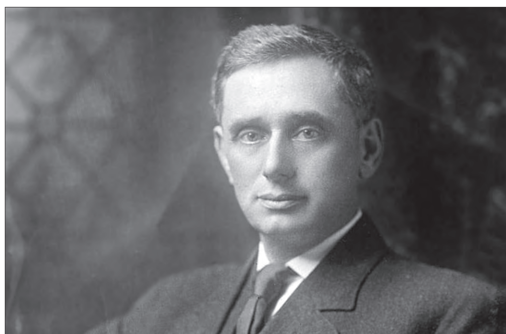
U.S. Supreme Justice Louis D. Brandeis spoke about fear, the fear of some to refrain from speaking out against those in power.