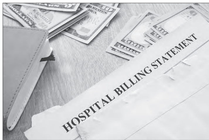
The No Surprises Act, which passed Congress in 2020 and took effect in 2022, largely prohibits health care providers from sending "surprise" bills to patients for out-of-network services that they did not choose to receive.

That means that who pays for the services, and how much,