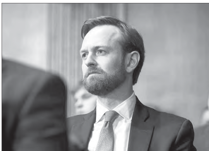
Federal Trade Commission Chair Andrew Ferguson

Behavioral remedies, by contrast, merely call for the merged entity to avoid taking anticompeti-