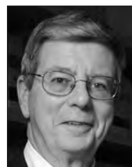
District Judge John G. Koeltl Southern District

The court denied Maxim Inc.'s request for a preliminary injunction against Playboy in a dispute alleging Playboy copied the mechanics and structure of Maxim's modeling competition for its "Great Playmate Search." Maxim asserted trade secret, copyright, contract and unfair competition claims, alleging Playboy replicated features such as voting systems, tournament structures and user-generated content mechanisms. The court found Maxim failed to show irreparable harm, as Maxim waited months after learning of Playboy's competition to seek emergency relief and, during that period, pursued a potential business partnership rather than objecting to alleged infringement. The court noted that Maxim's own communications praised the contest's revenue potential and proposed future collaboration. The court also found Maxim was unlikely to succeed on the merits because many of the alleged trade secrets were publicly disclosed through competition rules, the claimed contest mechanics largely reflected unprotectable ideas rather than protected expression, and Maxim failed to show Playboy agreed to contractual restrictions or improperly acquired confidential information.