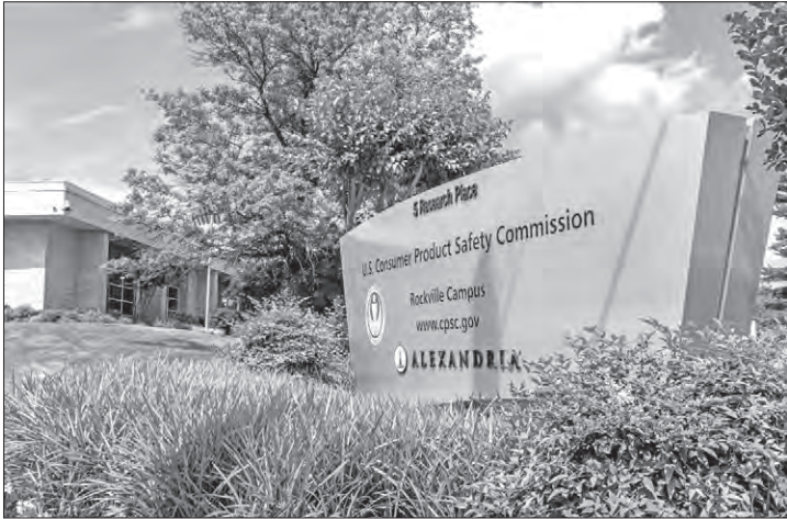
U.S. Consumer Product Safety Commission in Rockville, Md. The CPSC is a federal agency with broad authority to impose product safety regulations, issue recalls and impose fines and penalties.

“[F]urther percolation in the lower courts is not particularly useful because lower courts cannot alter or overrule this Court’s precedents,” Kavanaugh wrote. “In that situation, the downsides of delay in definitively resolving the status of the precedent sometimes tend to outweigh the benefits of further lower-court consideration.”