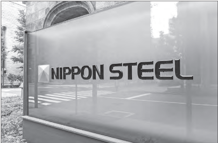
Big Law firms’ lobbying businesses brought in six- and seven-figure paychecks from companies and industry groups in the second quarter of this year. Some of law firms biggest clients in Q2 were Nippon Steel, Apollo Global Management, Barrick Mining Corp. and AIG.

Even firms that don’t have large lobbying businesses generated fees last quarter.