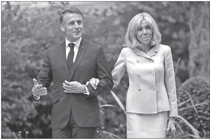
The 219-page complaint challenges a series of statements made by conservative podcaster Candace Owens, right, including allegations that Brigitte Macron was born male and Emmanuel Macron ’s election as president was the result of CIA-backed conspiracy.

It states the lawsuit follows three retraction demands the Macrons have sent to Owens within the past year which included evidence the challenged statements were false.