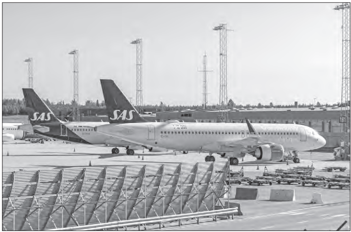
Planes of SAS Scandinavian Airlines on Oslo Gardermoen Airport. Air France-KLM said it would initiate proceedings this month to acquire a majority stake in Scandinavian Airlines (SAS).

Skadden and Portuguese law firm J+ Legal are advising Air France-KLM on the matter, with Paris-