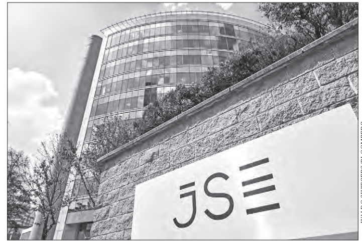
Johannesburg is hoping to strengthen the stock exchange with a pipeline of potential listings including Coca-Cola, but political uncertainty and trade tensions with the U.S. are causing unease.

Questions? Tips? Contact our news desk: editorialnylj@alm.com