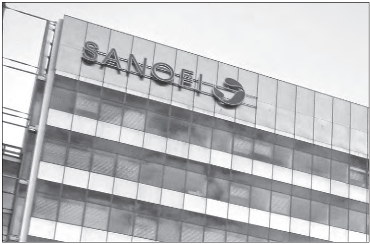
Paris-based drugmaker Sanofi is acquiring U.K.-based Vicebio to gain its molecular clamp vaccine technology, with the total price contingent on future development beyond the $1.15 billion upfront payment.