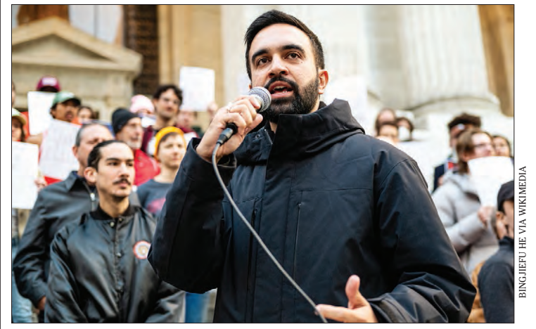
Zohran Mamdani at the Resist Fascism Rally in Bryant Park on Oct. 27th 2024.