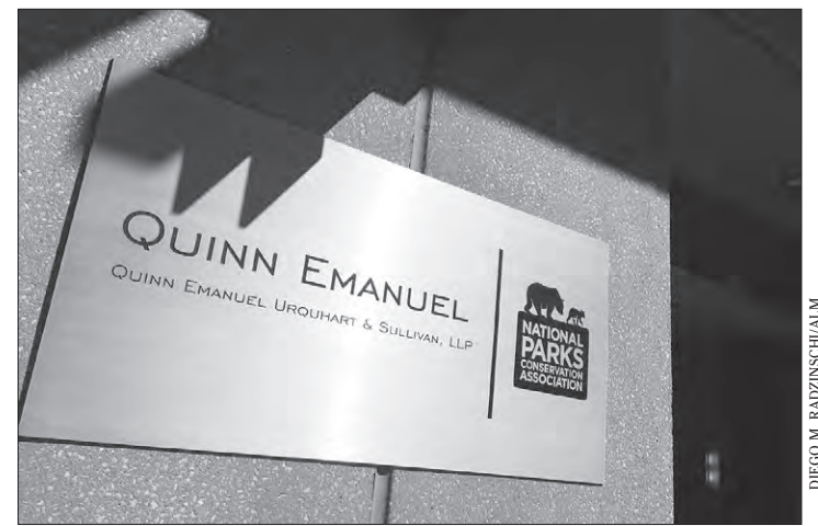
Quinn Emanuel was awarded the most significant chunk of the total award, with more than $2.2 million for nearly 1,512 hours.

Linares, the special master appointed to the case, discovered