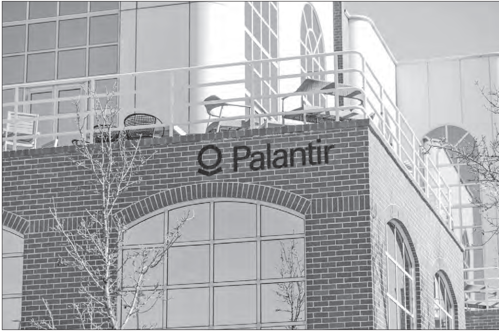
Palantir for years has been used for security and safety purposes by military and intelligence agencies, police departments, immigration officials, banks, and many other institutions.