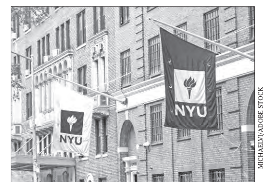
New York University secured the largest lease, totaling 1.07 million square feet in Greenwich Village.