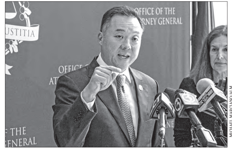
"We've stopped them over and over again," Connecticut Attorney General William Tong said.

"We're talking about funding to improve the quality and effectiveness of teachers," Tong said. "Title III funding for English language learning, Title IV funding for the use of technology in our schools... This money goes to funding positions for social workers and counselors and focusing on student well-being."