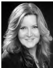
Justice Nancy M. Bannon Supreme Court

In a breach of contract action, the plaintiff moved for summary judgment on all causes of action of the amended complaint, dismissal of the defendants' counterclaims, and damages of $1,106,281 plus attorney's fees. The defendants opposed the motion and cross-moved for partial summary judgment on the issue of liability for storage expenses. The plaintiff's motion was granted on the first and third causes of action. The court held, as it pertained to the first cause of action, that plaintiff was able to show their prima facie case that defendant violated one of the term agreements in the contract. As for the third cause of action, the court held the defendants' failure to reimburse the plaintiff for storage fees was not an express breach of the parties' agreement as storage fees fell outside the scope of the agreement nor did it constitute a recognizable tort.