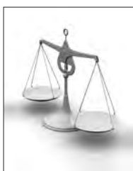
Justice Francis A. Khan III Supreme Court

Plaintiff brought an action to foreclose on a consolidated mortgage encumbering a parcel of commercial real property known as 514 West 44th Street in New York. The mortgage was given by 514 West 44TH Street Inc., non-party Columbia Capital Co. to secure a consolidated and restated mortgage note with an original principal amount of $2,750,000.00. Plaintiff commenced the action alleging defendants defaulted in repayment under the note. Plaintiff brought a summary judgment motion which was denied. Plaintiff then moved to reargue which was denied, but the court decided to treat it as a successive summary judgment motion. The motion was granted. The court held through affidavits and supporting documents, the plaintiff established the mortgage, note, evidence of mortgagor's default as well as its standing and was sufficiently supported by appropriate documentary evidence.